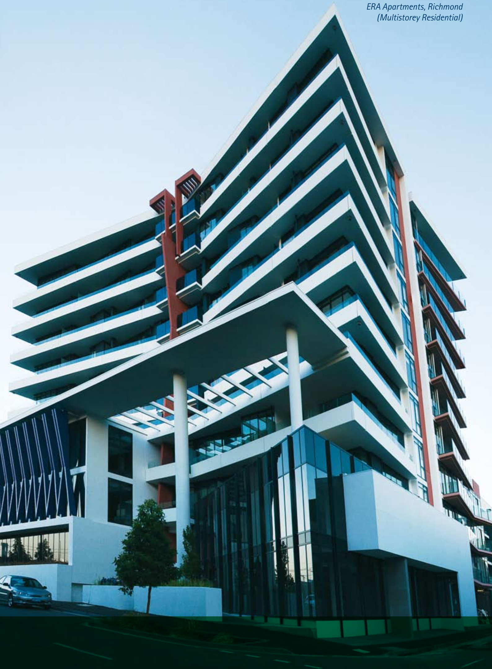
ERA Apartments, Richmond (Multistorey Residential)