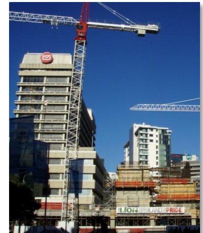
Featherstone Street, Wellington, New Zealand