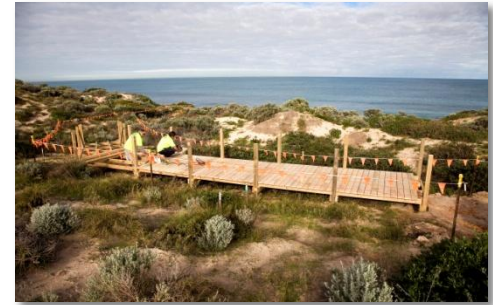
Foreshore Management Plan Project, Western Australia