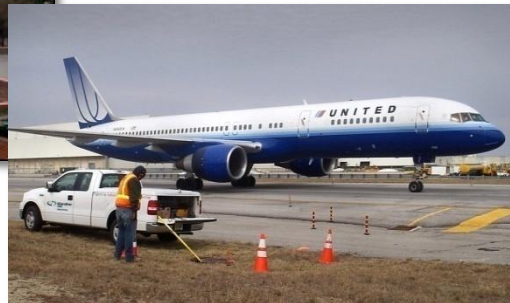
Subsurface Utility Engineering, JFK International Airport, United States