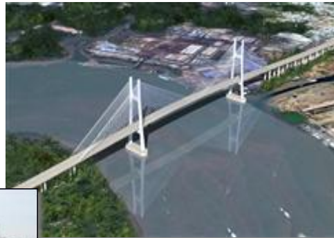
Phu My Bridge, Ho Chi Minh City, Vietnam