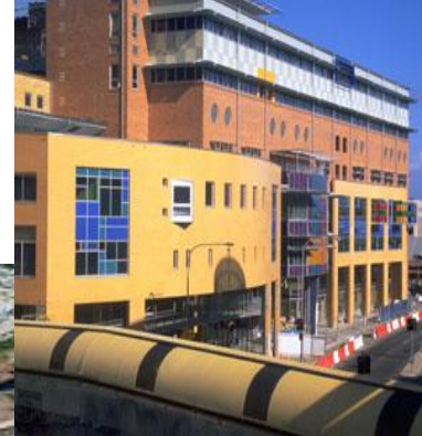
Mater Children's Hospital, Brisbane