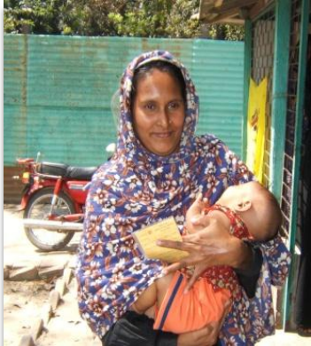
Healthcare Project, India