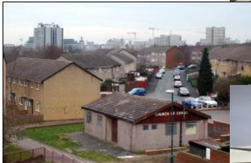
WinDes Software Project Stonebridge Park, England