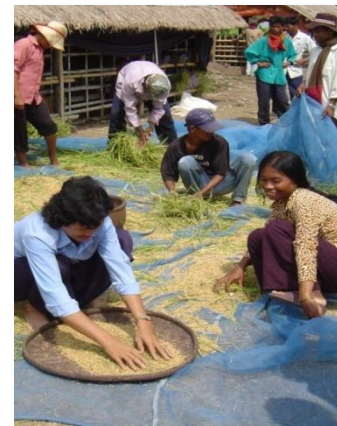
Agriculture Quality Improvement Project, Cambodia